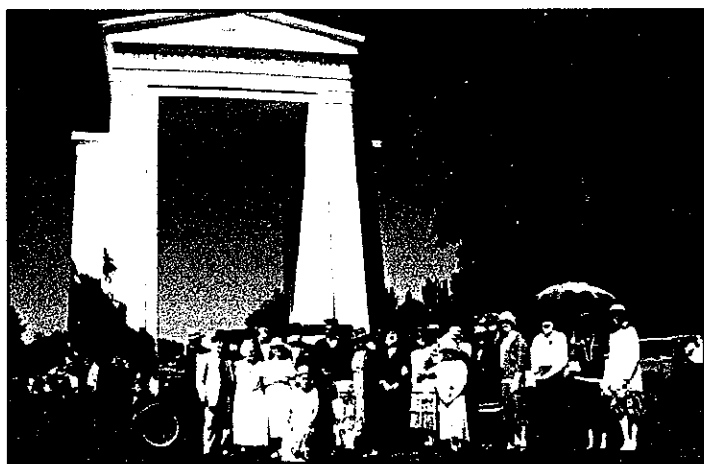
Peace Arch Dedication "Sam Hill" Days Reenactment Ceremony

Our activities include visual and performing arts, special events and historical reenactments, and educational programming.